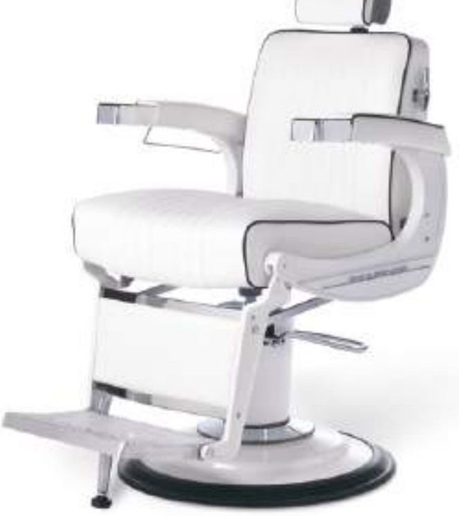
APOLLO 2 ELITE - SINCE 2016

The first evolution of the Apollo 2 dynasty with refined matt or gloss black or white gloss metalwork and contrasting piping.