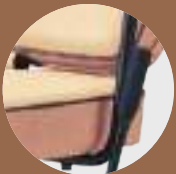
Standard Recline Handle on Left or Right