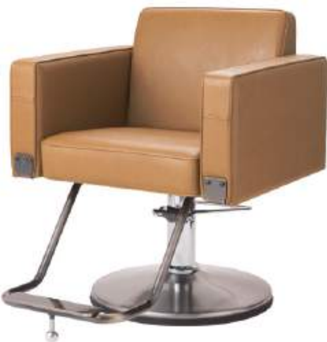
A1205 With Antiqued Footrest

Strong and solid in appearance and function, a 360° lockable base and metal or antique footrest delivers on style, comfort and performance.