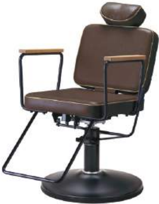
A1601M VT2 with VT5 Piping

Evokes the essence of true vintage with a reclining backrest, adjustable and removable headrest, 360° lockable rotation and hydraulic base options.