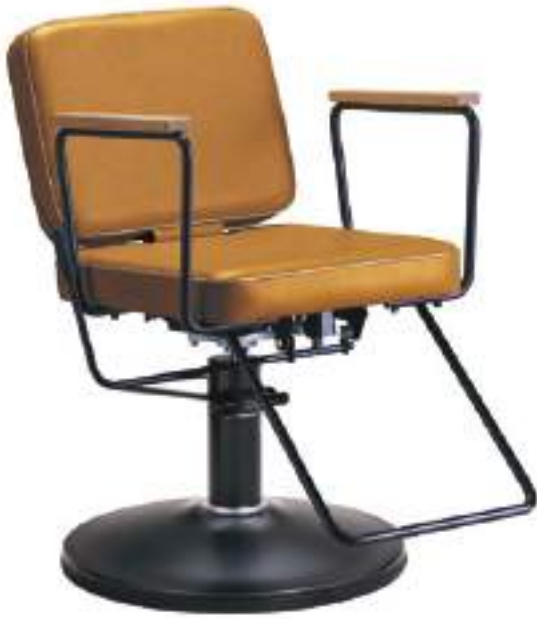
A1601S VT4 with VT5 Piping

A reclining backrest, 360° lockable rotation, hydraulic height adjustment and a stylish footrest are both contemporary and functional.