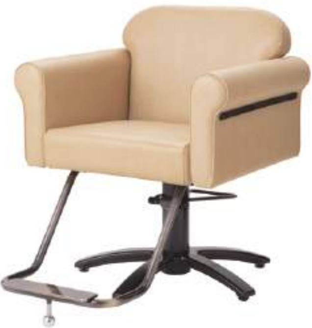
A1204 With Antiqued Footrest

A low backrest and bold armrests ensure comfort and accessibility as you customise with a metal or antique footrest for extra style. Features a 360° lockable rotating base.