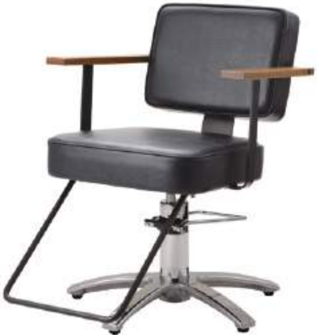
A1201 With Metal Trim Footrest

Wooden armrests, a hand-studded backrest and retro styling that is convincing in every way. Wooden armrests can be complemented with a wood trim or black metal footrest.