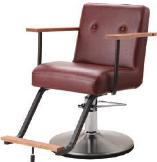
A1202 With Wood Trim Footrest

Authentic retro styling inspired by our rich heritage. Genuine wooden armrests and black metalwork add to its vintage appeal whilst a 360° lockable rotating base ensures modern performance. Also available with wood trim or metal footrest.